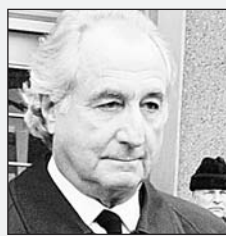
BERNIE MADOFF, 70